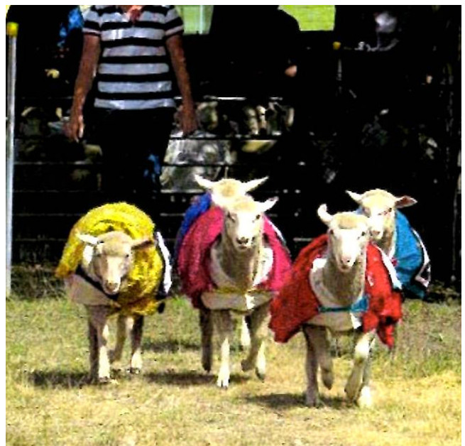
Below, Sheep racing at Kempton Festival 2017