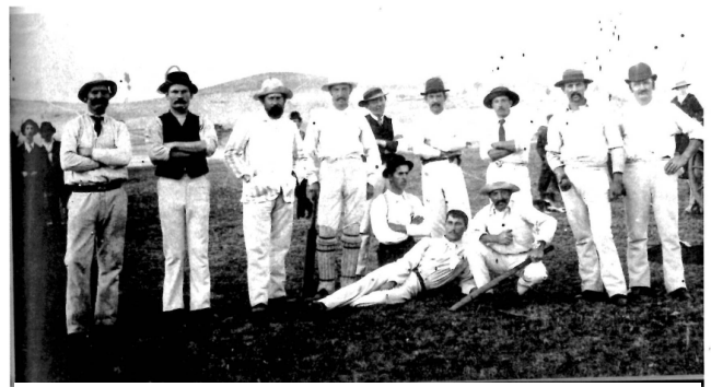
Green Ponds Cricket Club c 1900

Photographs and historical information courtesy Alan Townsend, SM Council.